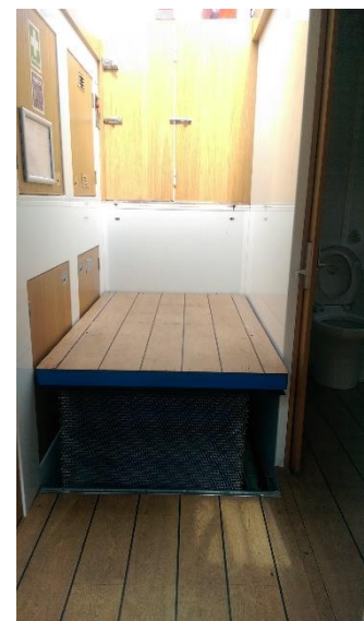
Images showing the gangplank and lift